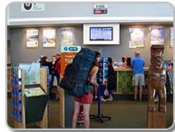
In the Tourist Center