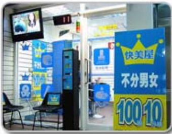
In the Hair Dresser