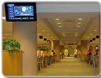
In the Bank