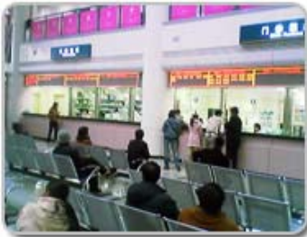
In the Hospital