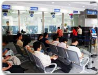
In the Government Office