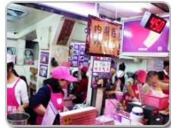
In the Food Court